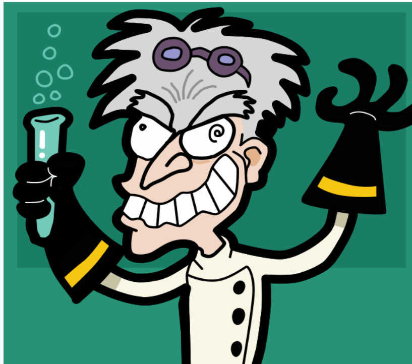
Image created by J.J. Used with permission under a GNU Free Documentation License.